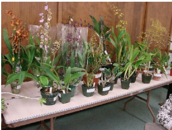
Plenty of Plants to Auction