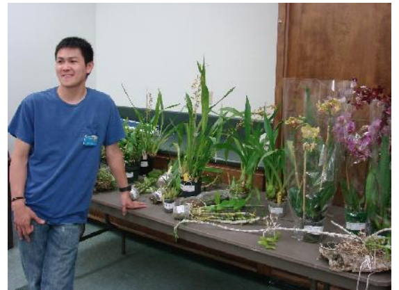
Beautiful Plants for Sale