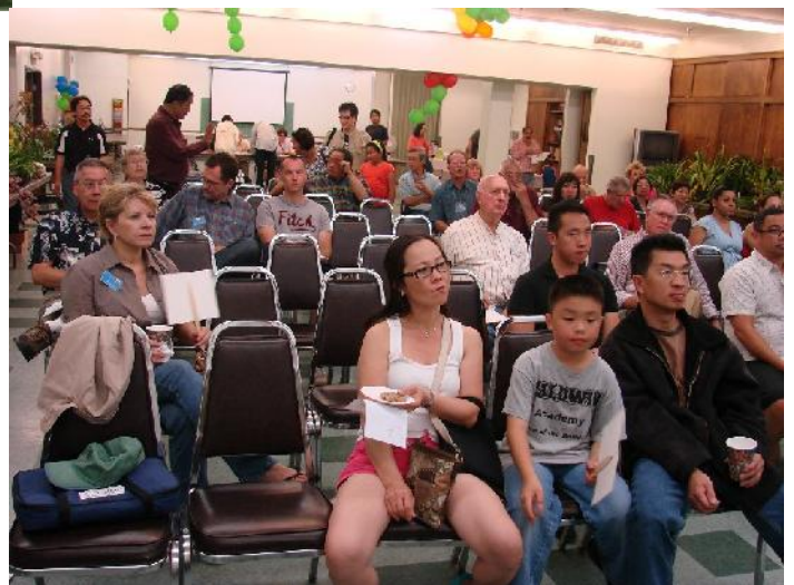
SGVOH Members and Guests