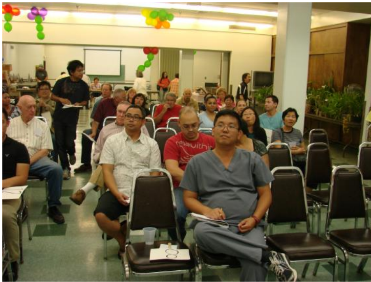
SGVOH Members and Guests